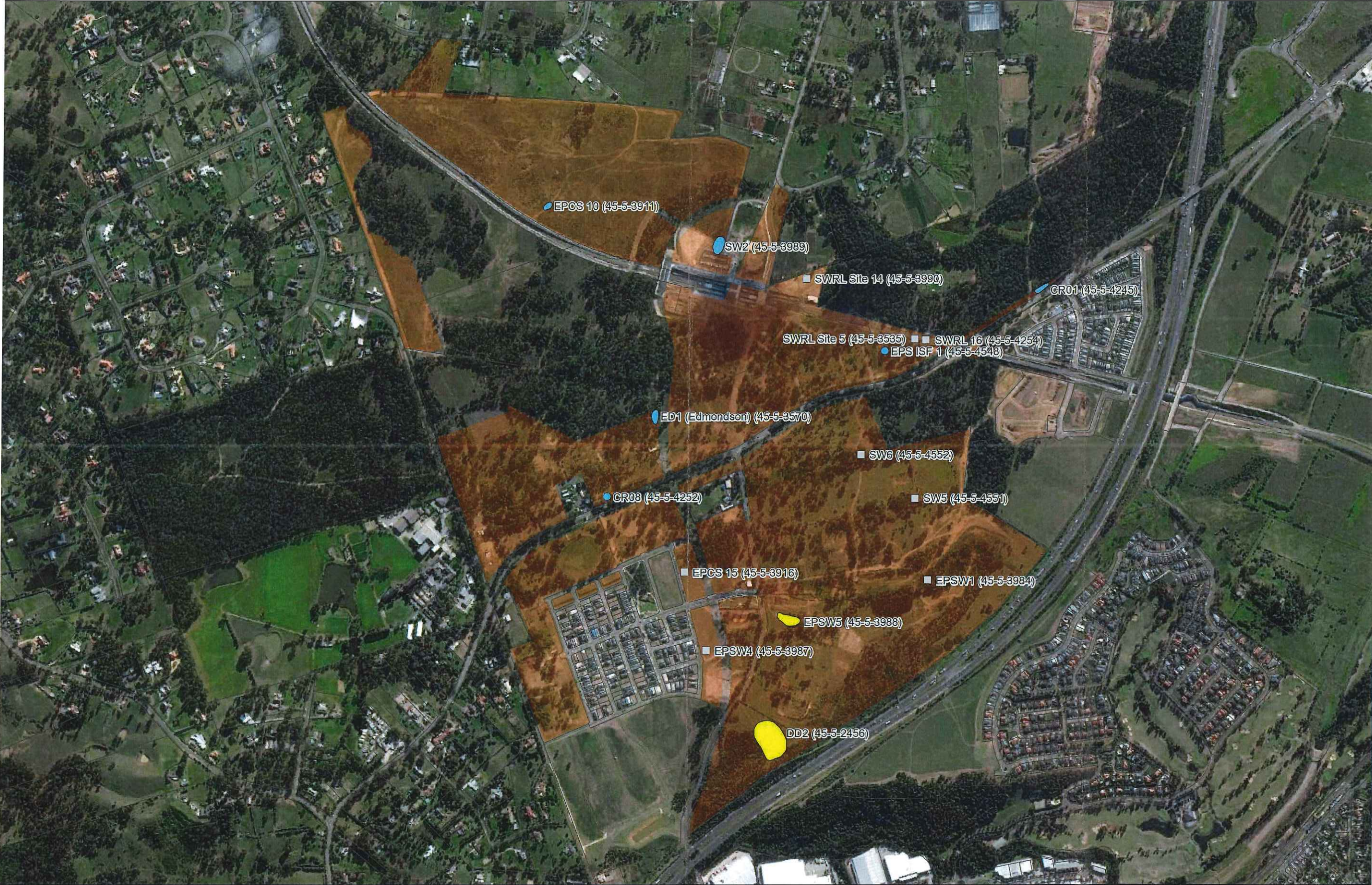
Attachment 2 of AHIP C0001134 (sheet 2 of 2): Locations where Community Collection will occur in accordance with the conditions of this AHIP. These areas are shaded blue and labelled as sites “CR01”; “CR08”; “ED1”; “EPCS 10” “EPS ISF 1” and “SW 2”.